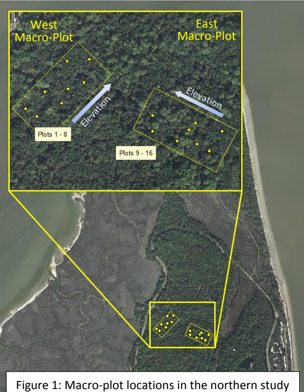
Figure 1: Macro-plot locations in the northern study site. Plot numbers refer to pairs of fenced and unfenced 10x10m herbivore plots.

The first research activity is a spatial-environmental study of plant community response to stressors . The basic idea is to look at the spatial patterns of environmental conditions, then map the locations of all individual saplings and mature trees, and the density of seedlings, of different tree species. We are analyzing these data to determine whether seedlings are occurring in the same or different locations relative to the parental generation of trees, and the environmental conditions associated with observed