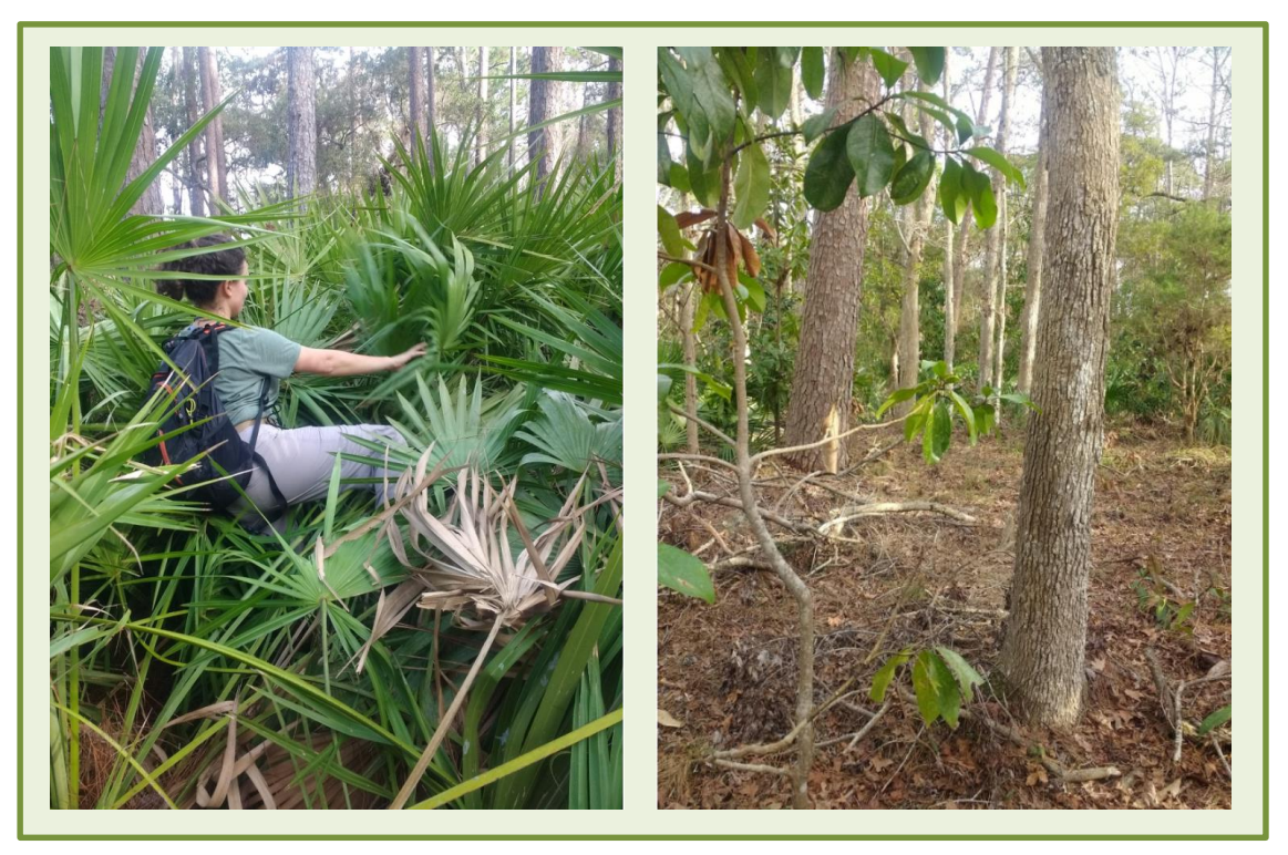
Figure 3: Camphor tree-invaded site near Shell Road. Left: Masters student Dessa Dunn makes her way through the saw palmetto shrub layer, which almost entirely fills the understory. Due to its density, there is very low plant diversity in most of the forest understory. Right: There are occasional, distinct clearings in the palmetto, such as that pictured here. These commonly have invasive camphor trees (which have been killed by JIA conservation staff), as well as recovering bay trees (foreground), but a very sparse herbaceous layer and thick pine litter on the ground. These clearings are the focus of our research.

In total, we identified 32 clearings that were at least 6m across, of which a randomly selected 24 will serve as research plots. In 12 clearings, we are erecting 6x6m deer exclosures, and the other 12 will remain unfenced. In each fenced and unfenced plot, we will clear the litter on half of the plot, and leave the litter layer intact on the other half. We will carefully monitor the response of all herbaceous and shrub species to the experimental treatments, and also track associated changes in soil moisture. Experimental setup and baseline data collection will be completed in April 2018.